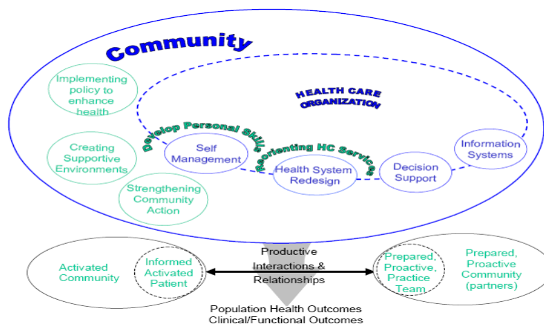
Figure 2 -- The Expanded Chronic Care Model (Barr 2003)

The model, Figure 2 , includes: (i) self-management resources, located in community centres and schools; (ii) consultation, with volunteer and citizen groups, to ensure that all available supports are utilized; (ii) collaborative decision-making, between professionals and clients, to encourage clients to become full partners in their care; (iii) e-health systems,